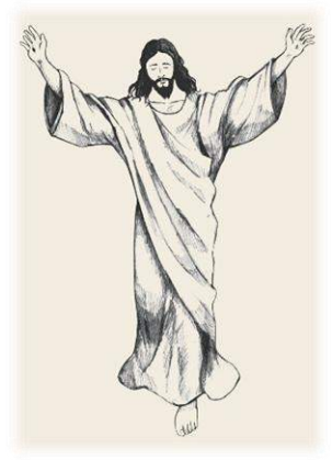
ONE CAN TRUST

Please attend a special service for Ascension Day.